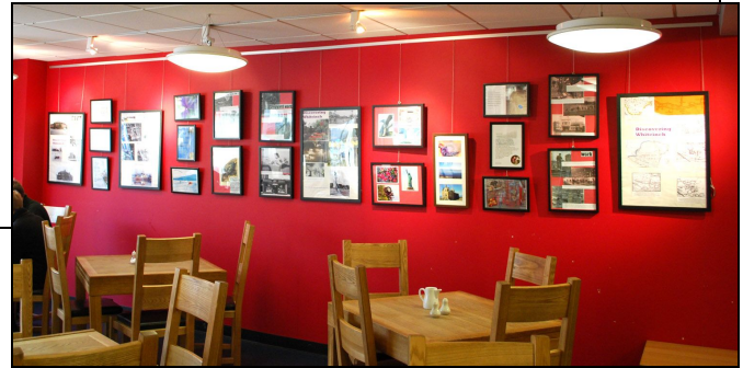
Display of work produced in Whiteinch Centre classes in 2010. Work includes Local History displays and photos and graphics from Digital Photography classes.